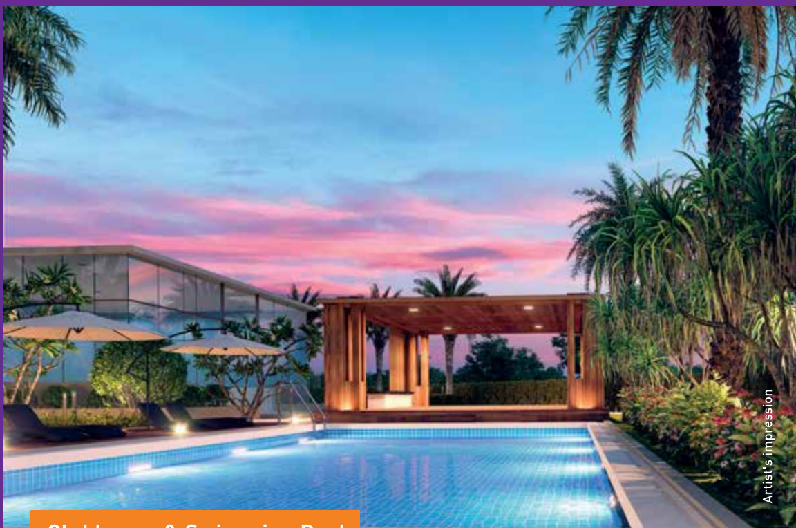
Clubhouse & Swimming Pool